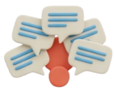
EXPERT-MONITORED DISCUSSION FORUM