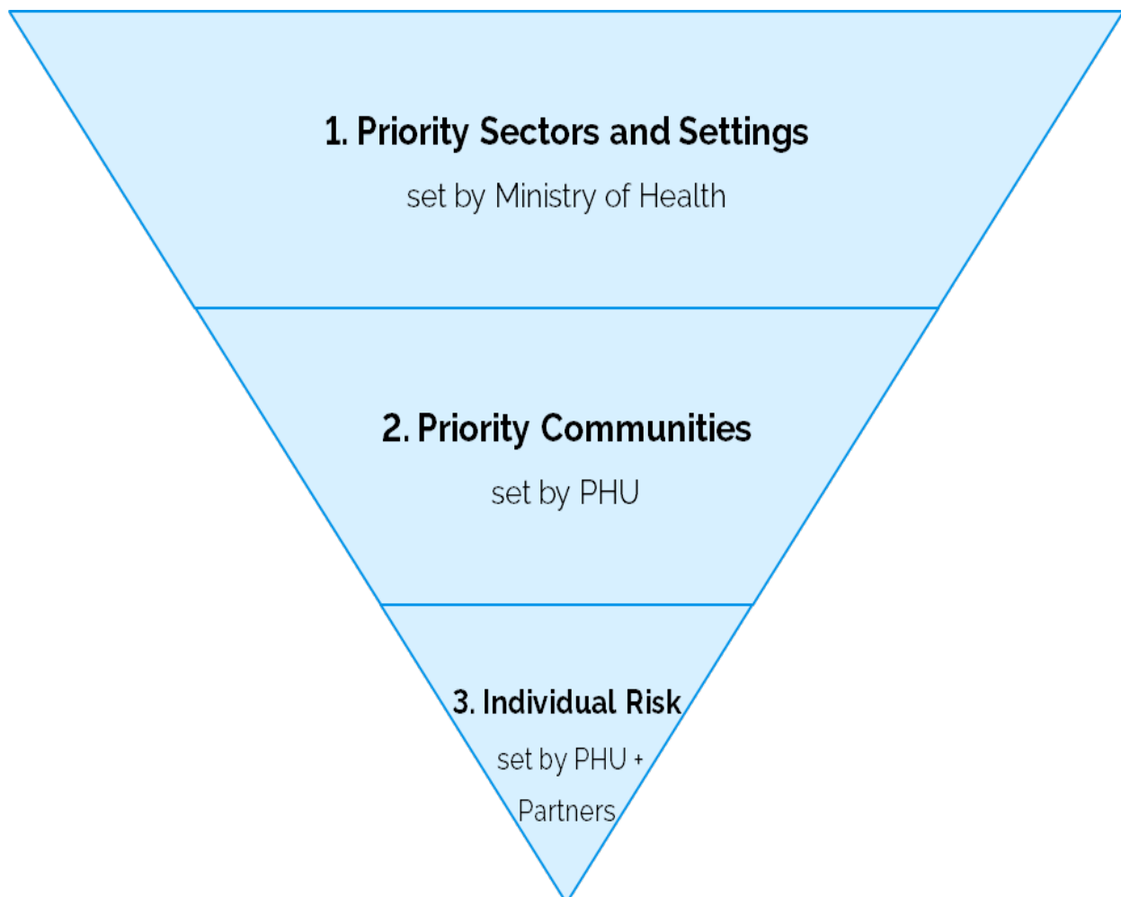
Fig. 1 Approach to Prioritization

A stepwise approach to prioritization has been developed which considers multiple factors including the sectors and settings that people work in, local and community factors as well as individual factors. Each step should be performed in sequence to gradually refine from the broad sector/setting level down to the individual level.